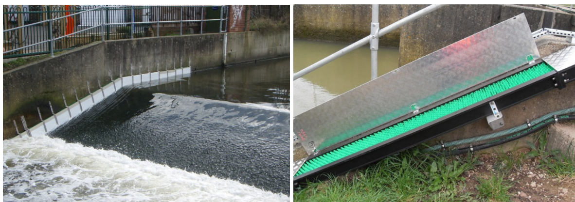
Figure 2. A vertical eel tile cassette (left) and eel climbing substrate contained within a rectangular channel (right).

For either pass type, a location on the left side of the weir would be preferable to limit potential exposure of eels to the intake on the right bank after they have moved upstream. On the downstream side of the weir the eel pass would need to extend to the bed level within the pool between the weir toe and the pre-barrage structure (59.68 mAOD), while on the upstream side of the weir it would be necessary to extend the eel pass for several metres upstream of the weir crest to reduce the risk of eels being swept back downstream during periods when there is a flow over the weir.