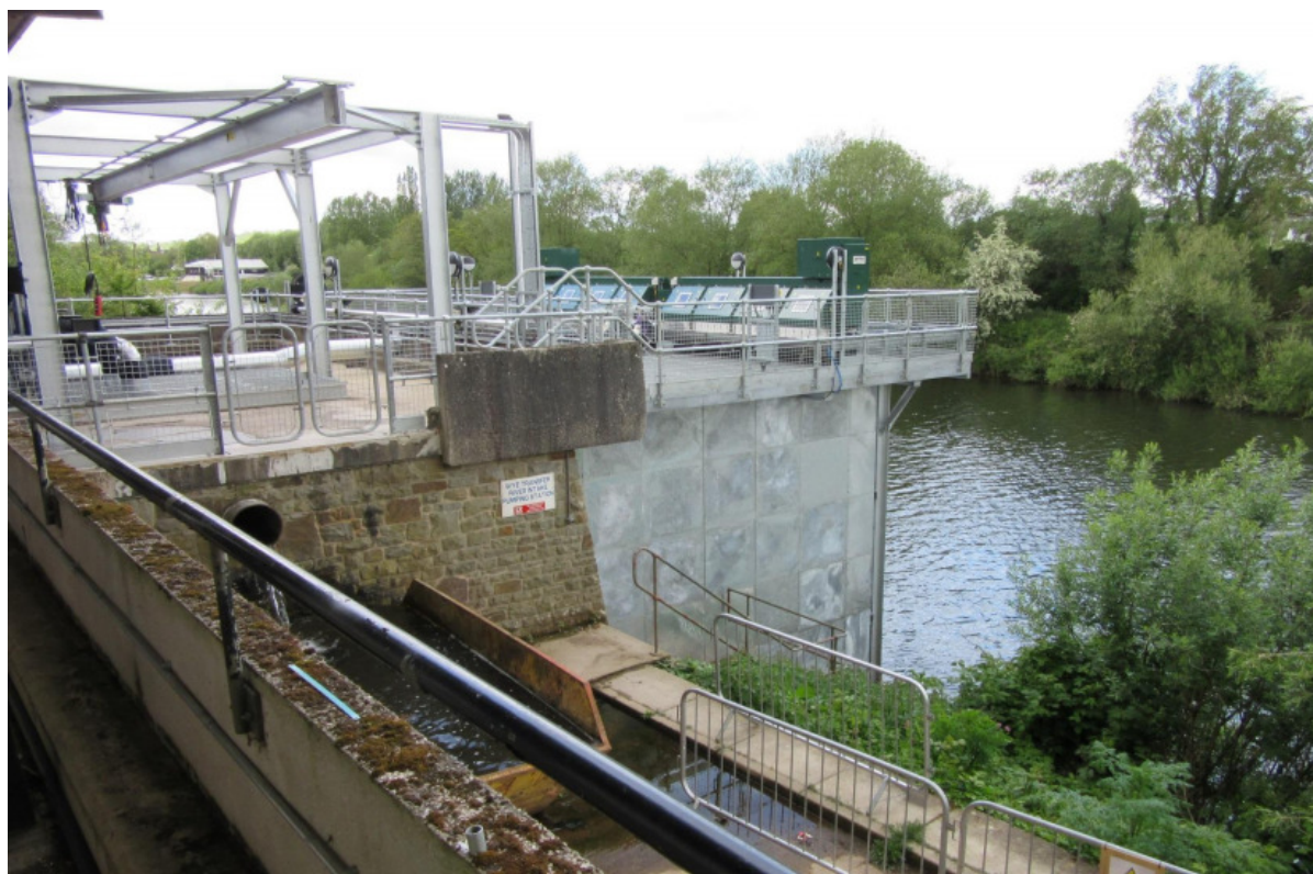
Figure 4-1. An example of a vertical travelling screen solution at a water intake of comparable scale to Hampton Load.