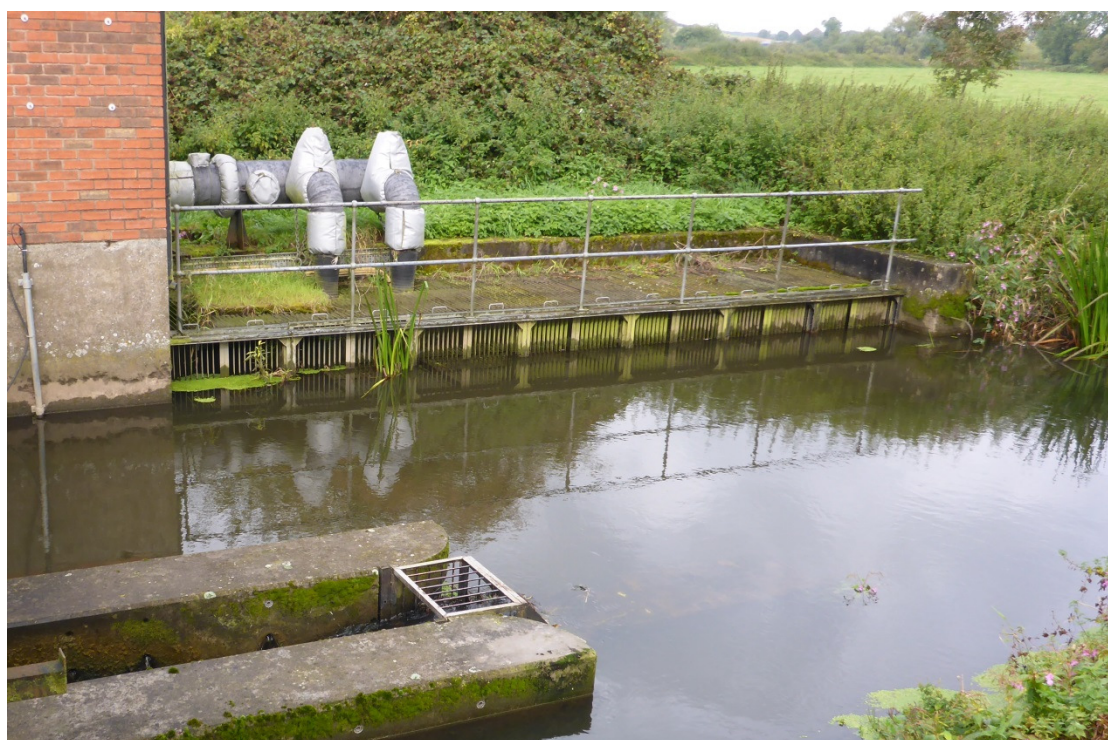
Figure 2-1. The Nethertown intake structure, with the existing vertical coarse bar screens visible.

The Nethertown Blithe intake is on the River Blithe ~122km upstream of the tidal limit. The current intake is ~7m wide with vertical bar screens with ~30mm bar spacing. The screens are currently manually cleaned. The intake structure is orientated broadly parallel to the direction of river flow, although it is set back approximately 0.5 metres from the adjoining wing walls and river bank and is therefore not currently flush with the river bank.