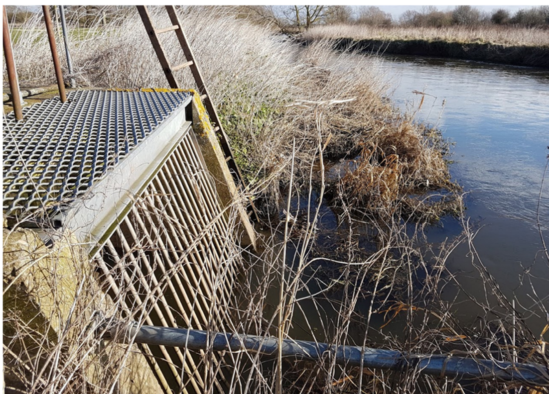
Figure 3-1. The River Trent recirculation intake on the left bank of the River Trent (river flowing bottom to top).

The Nethertown Trent intake is on the River Trent ~121 km upstream from the tidal limit. The current intake is ~2.5m wide with a trash rack with ~80mm bar spacing. The screens are currently manually cleaned. The existing intake (Figure 3-1) is orientated at < 20 degrees to the direction of river flow. In accordance with EA (2015) eel screening guidance, a maximum mesh size of 12.5 mm and a maximum screen approach velocity of 0.40 m/s would therefore, be acceptable for the protection of eel.